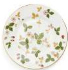
PLATE 15.4CM 6IN