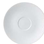
GIO SAUCER 17.75CM/7IN