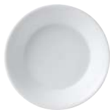
CONNAUGHT FRUIT SAUCER 13CM/5.1IN