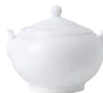
I46 COVERED SUGAR L 11CM/4.3IN