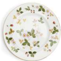
PLATE 27.3CM 10.7IN