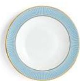
RIM SOUP PLATE 23CM 8.9IN