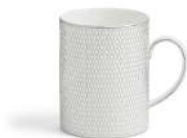
MUG 340ML 11.5FLOZ