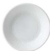
GIO DISH 8CM/3.1IN