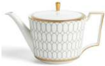
TEAPOT 1.1L 37.3FLOZ