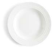
RIM SOUP PLATE 22.8CM 8.9IN