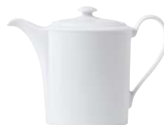
DELPHI COFFEE L POT 75CL/26.4OZ