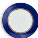
PLATE 20.6CM 8.1IN