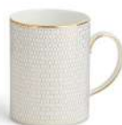
MUG 340ML 1l.5FLOZ