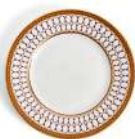
PLATE 15.4CM 6IN