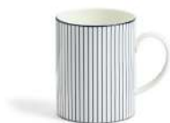
MUG 293ML 9.9FLOZ PINSTRIPE WHITE