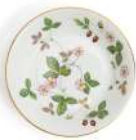
FRUIT SAUCER 12.8CM 5IN