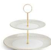
2 TIER CAKE STAND