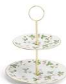
2 TIER CAKE STAND