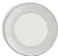
PLATE 28.2CM 11.1IN