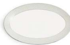
OVAL DISH 26CM 10.2IN