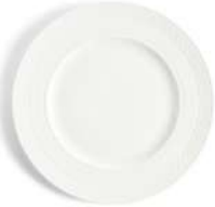
PLATE 27.3CM 10.7IN