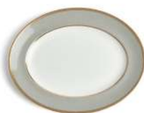
OVAL PLATTER 35.7CM 14IN