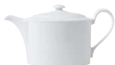
DELPHI TEAPOT L 62CL/21.8OZ