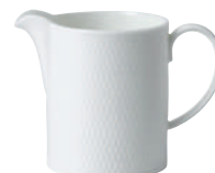
GIO CREAM JUG 32.5CL/11.4OZ