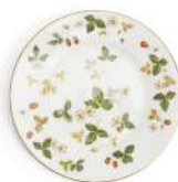
PLATE 20.6CM 8.1IN