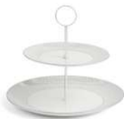
2 TIER CAKE STAND