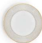
PLATE 17CM 6.7IN