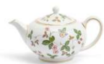
TEAPOT 400ML 13.5FLOZ