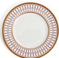
PLATE 27.3CM 10.7IN