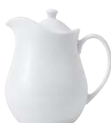
SAVOY COVERED JUG 40CL/14.1OZ