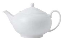
I46 TEAPOT L 80CL/28.2OZ