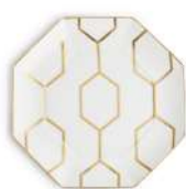
OCTAGONAL PLATE 23.4CM 9.2IN WHITE