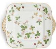
SQUARE CAKE PLATE 29.3CM 11.5IN