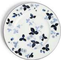
PLATE 27.3CM 10.7IN