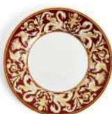
ACCENT PLATE 22.8CM 8.9IN