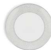
PLATE 20.6CM 8.1IN