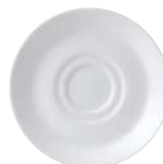
CONNAUGHT SAUCER 12CM/4.7IN