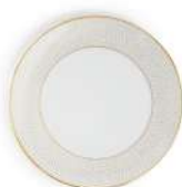
PLATE 20.6CM 8.1IN