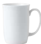
CONNAUGHT BEAKER 28CL/9.9OZ