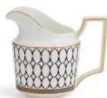
CREAMER 259ML 8.7FLOZ