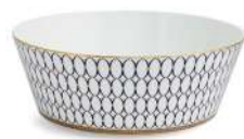
SERVING BOWL 25.8CM 10.1IN