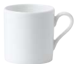
CONNAUGHT COFFEE BOND 8CL/2.8OZ