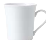
DELPHI BEAKER 26CL/9.1OZ