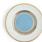
PLATE 15CM 6IN