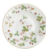
RIM SOUP PLATE 20.3CM 7.9IN