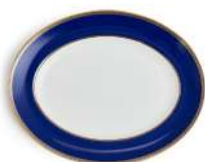
OVAL PLATTER 35.7CM 14IN