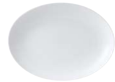
CONNAUGHT OVAL PLATTER 29X21.5CM/11.4X8.5IN