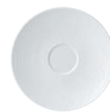
GIO ESPRESSO SAUCER 13.3CM/5.2IN