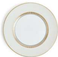
PLATE 27.3CM 10.7IN