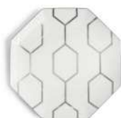
OCTAGONAL PLATE 23.4CM 9.2IN