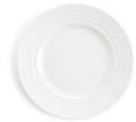
PLATE 15.4CM 6IN