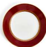
PLATE 20.6CM 8.1IN