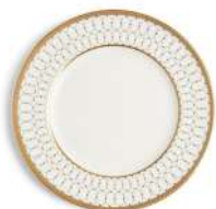
PLATE 27.3CM 10.7IN