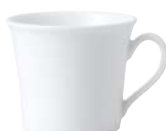
DELPHI COFFEE CUP 8CL/2.8OZ