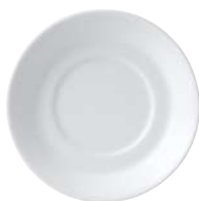
DELPHI SAUCER 14CM/5.5IN