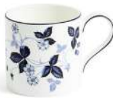
MUG 326ML 11FLOZ