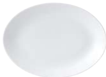
CONNAUGHT OVAL PLATTER 22.7X16.5CM/8.9X6.5IN