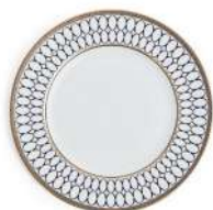
PLATE 27.3CM 10.7IN