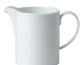
GIO CREAM JUG 15CL/5.3OZ