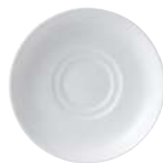
CONNAUGHT SAUCER 14CM/5.5IN