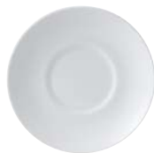
CONNAUGHT SAUCER BOND 12.2CM/4.8IN