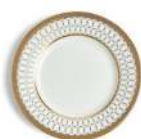
PLATE 15.4CM 6IN