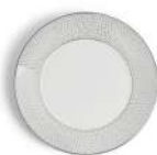
PLATE 17CM 6.7IN