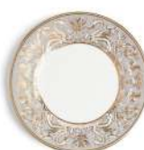
ACCENT PLATE 22.8CM 8.9IN