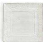
TRAY 14.9CM 5.8IN, SET OF 2