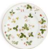
PLATE 22.8CM 8.9IN