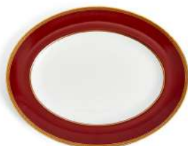
OVAL PLATTER 35.7CM 14IN