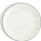
PLATE 23.8CM 9.3IN BLUE LINE