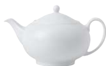
I46 TEAPOT S 40CL/14.1OZ