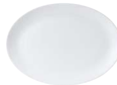
CONNAUGHT OVAL PLATTER 35.5X25.5CM/14X10IN