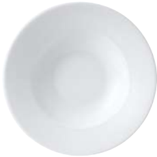
CONNAUGHT DEEP PLATE 28.5CM/11.2IN