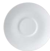
CONNAUGHT SAUCER 16CM/6.3IN