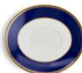
SAUCE BOAT STAND 20.8CM 8.1IN