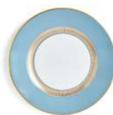
PLATE 20CM 8IN