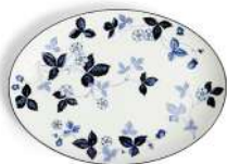
OVAL SERVING PLATE 29.8CM 11.7IN