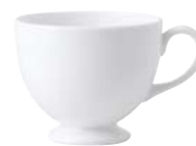
LEIGH TEACUP 17.5CL/6.2OZ