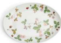
COUPED OVAL PLATE 29.8CM 11.7IN