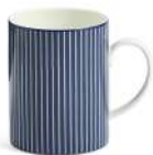
MUG 293ML 9.9FLOZ PINSTRIPE BLUE