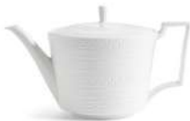
TEAPOT 1104ML 37.3FLOZ