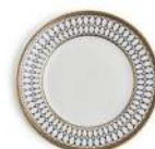
PLATE 17.8CM 7IN