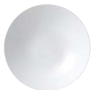
GIO COUPE BOWL 23.5CM/9.3IN