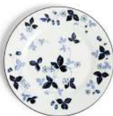
PLATE 20.6CM 8.1IN