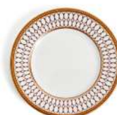
PLATE 17.8CM 7IN