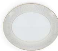
OVAL PLATTER 33.2CM 13IN