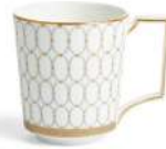
MUG 300ML 10.1FLOZ