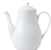
SAVOY COFFEE POT S 66CL/23.2OZ