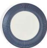
PLATE 23.8CM 9.3IN PINSTRIPE BLUE