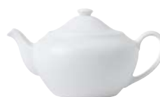
SAVOY TEAPOT L 87CL/30.6OZ