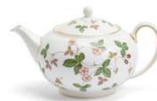
TEAPOT 800ML 27FLOZ