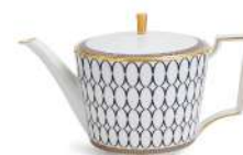
TEAPOT 1.1L 37.3FLOZ