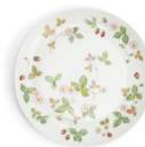
COUPE PLATE 23.5CM 9.2IN