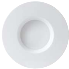
CONNAUGHT PASTA 28CM/11IN