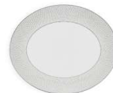
OVAL PLATTER 33.2CM 13IN