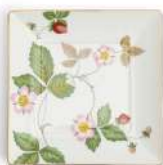
SQUARE TRAY 14.9CM 5.8IN