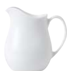
SAVOY JUG M 27CL/9.5OZ