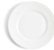
PLATE 20.6CM 8.1IN