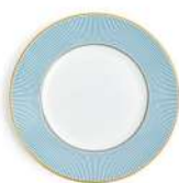
PLATE 23CM 8.9IN