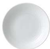
GIO DISH 10.5CM/4.2IN