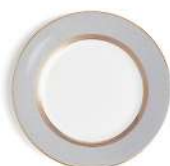
PLATE 20.6CM 8.1IN