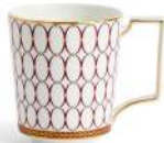
MUG 300ML 10.1FLOZ