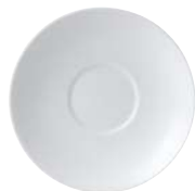
LEIGH SAUCER RIM 15CM/5.9IN