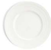
PLATE 22.8CM 8.9IN