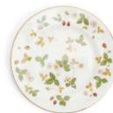
PLATE 17.8CM 7IN