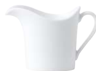
DELPHI CREAM S 8CL/2.8OZ