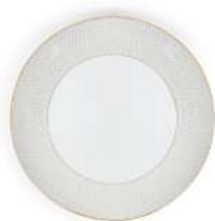
PLATE 28.2CM 11.1IN