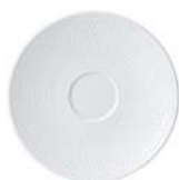
GIO TEA SAUCER 16.5CM/6.5IN