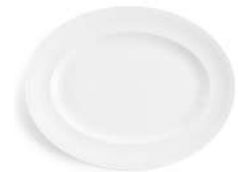
OVAL PLATTER 35.7CM 14IN