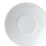
CONNAUGHT SAUCER CAN 12.2CM/4.8IN