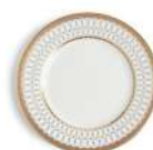
PLATE 17.7CM 6.9IN