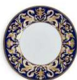
ACCENT PLATE 22.8CM 8.9IN