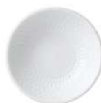
GIO DISH 6.5CM/2.6IN