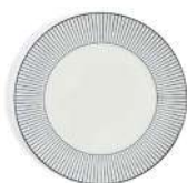
PLATE 23.8CM 9.3IN PINSTRIPE WHITE