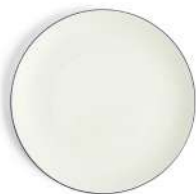
PLATE 28.2CM 11.1IN BLUE LINE