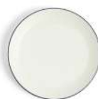
PLATE 17CM 6.7IN BLUE LINE