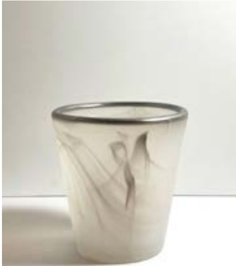
10oz Short Stack