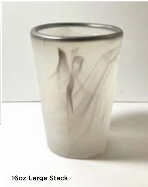
16oz Large Stack